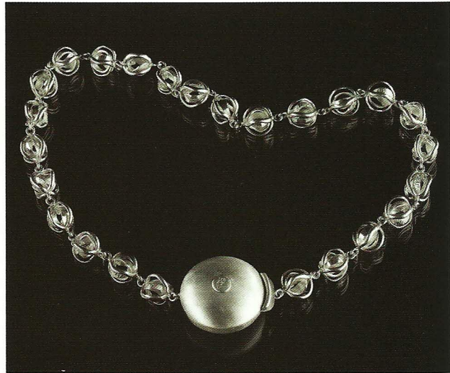
Out of Peru's Planeta necklace donated to the Inca Ball

For more information and to purchase tickets for the event see the Inca Ball website www.theincaball.com